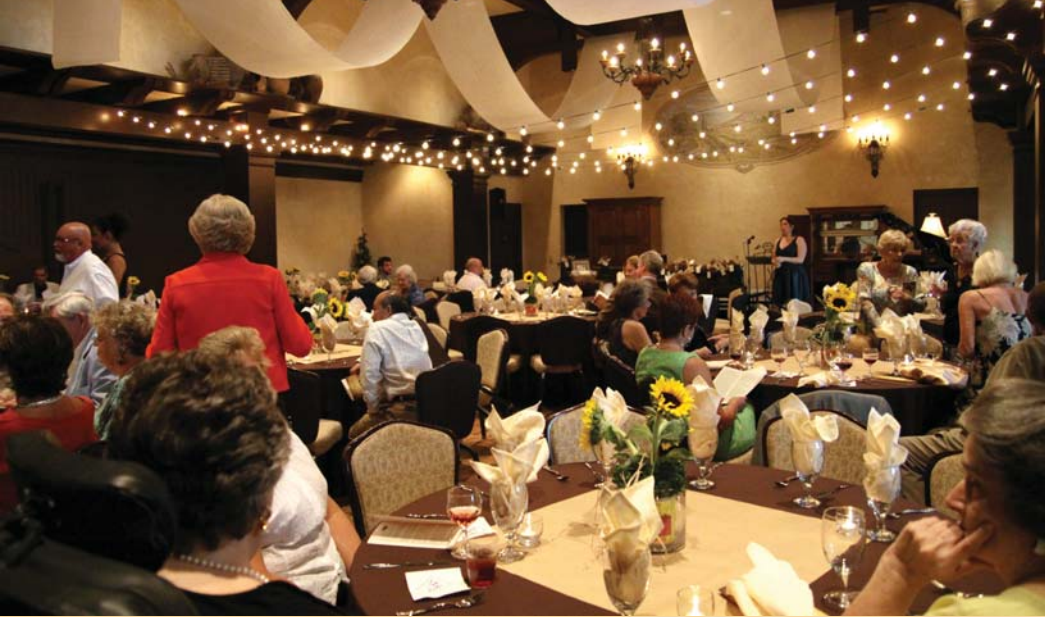
On arrival, guests were serenaded by members of Opera Carolina.